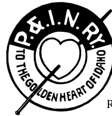
Replica of 1909 Logo

The ACHS cannot revive the faded memories of the Valley but we can preserve the Valley's history and assist in providing a facility and programs to present history, education and the arts for present and future generations. We need your membership and energy to help carry this mission into the future.